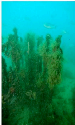
Day 60 10 cm diameter