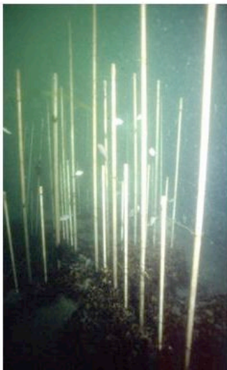
Day 1 16 mm diameter