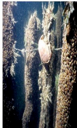
Day 180 30 cm diameter

FORTIUS, A DIVISION OF B.K.INTERNATIONAL BVBA