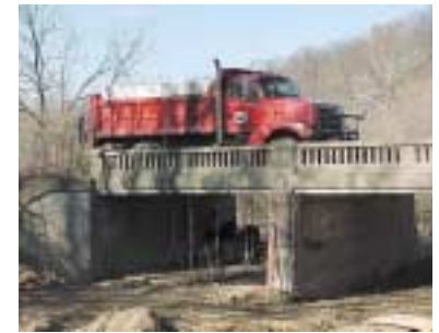
Figure 5: Bridge load test before strengthening.

$3.5/m for the epoxy paste. The labour cost for the FRP tape, including preparation of the structure, could be around $11.5/m (£8). It should be