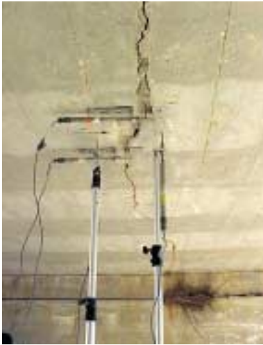
Figure 2: Longitudinal crack in soffit slab.

technology is on old Route 66, now Martin Springs Outer Road, in Phelps County, Missouri (Figure 1). The bridge was commissioned in 1926 and was originally on a gravel road. In 1951, the last miles of US Route 66 through Phelps County were concrete-paved, and in 1972 Route 66 was replaced by I-44. Commissioning of I-44 led to a significant decrease in traffic along Route 66. Load restrictions were placed on the bridge around 1985. This has a significant impact on