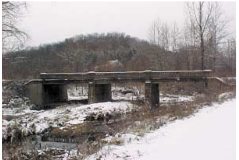
Figure 1: Three-span concrete slab bridge.